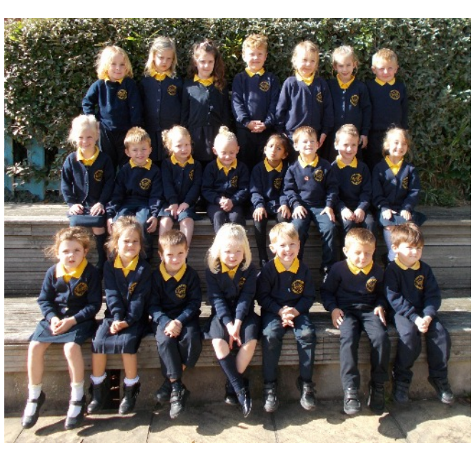
Welcome to Upper Beeding Primary School's New Starters in Reception!