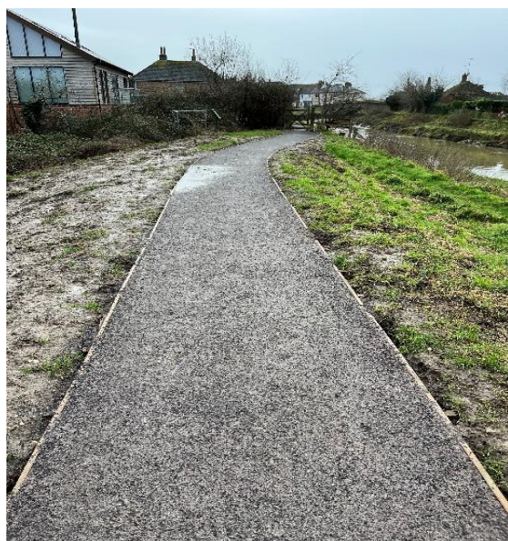
Photo of the completed pathway

The new pathway ensures a safe surface all year round and the Parish Council will be involved, where they can, to maintain the grass and hedges.